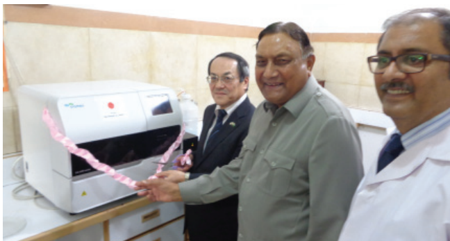
Ribbon Cutting of the Medical Equipment for Blood-Related Diseases to Fatimid Foundation from the Government of

The Government of Japan extended a grant of US$83,755 for the provision of a coagulation analyzer, a cell separator and two medical freezers under its Grant Assistance for Grassroots Human Security Projects (GGP) scheme. The equipment will allow the diagnosis and treatment services for the patients of blood-related diseases to significantly improve not only at the Karachi clinic but also at other Fatimid clinics in rural Sindh.